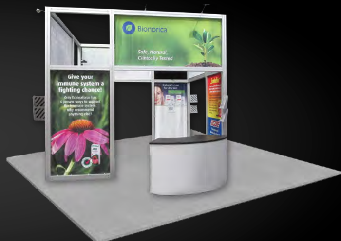
DESIGN #0325864 R-HP-K-18