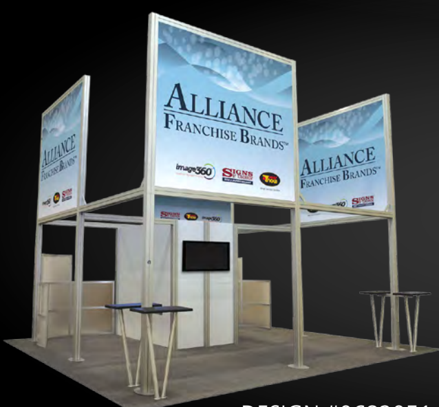
DESIGN #0682051 R-HP-K-19