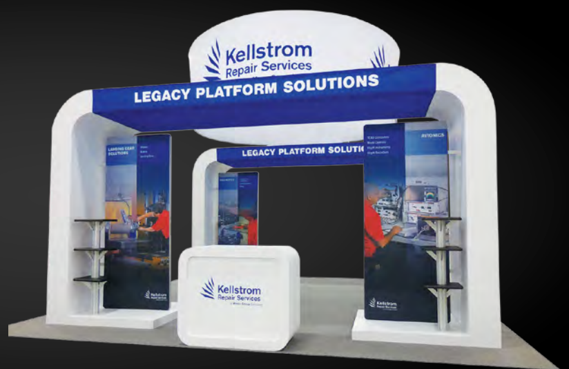
DESIGN #0584340 R-HP-K-20

Renting is easy – simply select the 20' x 20' island exhibit that fits your needs, design graphics to dress the display, and you're ready to showcase your brand. The only time investment is in the design and printing of purchased graphics, making it simple to obtain an impactful exhibit in a short period of time. All Hybrid Pro Modular rental display frames and purchased graphics are proudly manufactured and printed in the USA. Count on making an unforgettable impact with a rental Hybrid Pro 20' x 20' island exhibit kit.