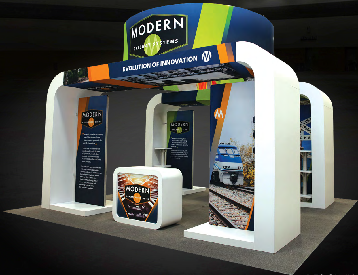
DESIGN #0633812 R-HP-K-20

Hybrid Pro™ Modular 20' x 20' rental island exhibits are the perfect rental solution for a budget-conscious exhibitor. Exhibits feature heavy-duty aluminum extrusion rented frames and state-of-the-art purchased push-fit fabric graphics. With several eye-catching, unique configurations to choose from, these exhibits are sure to WOW!