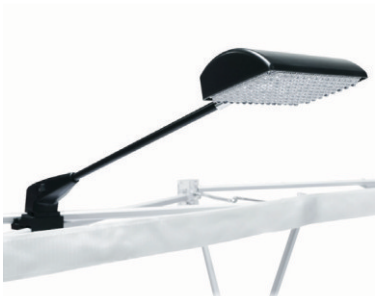
LED lights UL Listed (Optional)