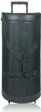
*Package includes padded nylon travel bag