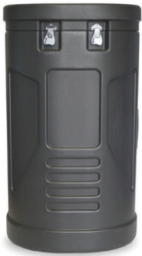
Oval Hard Shipping case