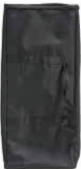
*Package includes padded nylon travel bag