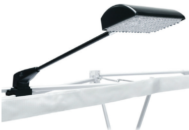
LED lights UL Listed (Optional)