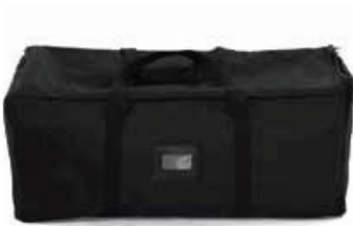
*Package includes padded nylon travel bag