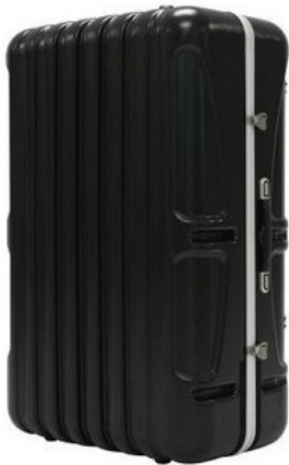
Hard Shipping case (Optional)