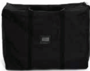
*Package includes padded nylon travel bag