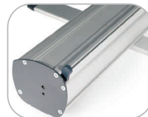
Silver aluminum base side profile shown with clamp top banner rail