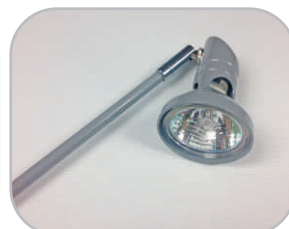
Halogen stem light fixture (Silver) *Optional accessory