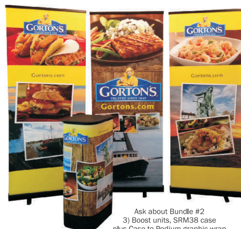
Ask about Bundle #2 3) Boost units, SRM38 case plus Case-to-Podium graphic wrap