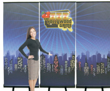
BST31-K3 Boost Kit 3