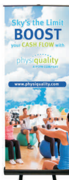
BST31-K2 Boost Kit 2