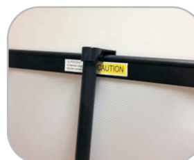
Secure 3-section pole top