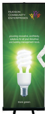
BST31-K1 Boost Kit 1