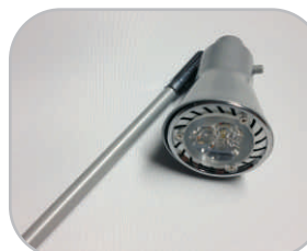
LED stem light fixture (Silver) *Optional accessory