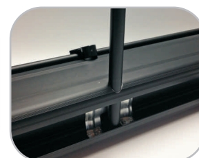
Secure pole assembly