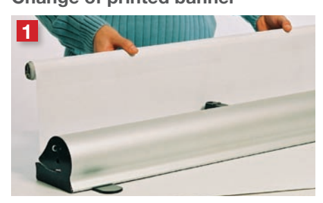
Roll the old banner out of the cassette.