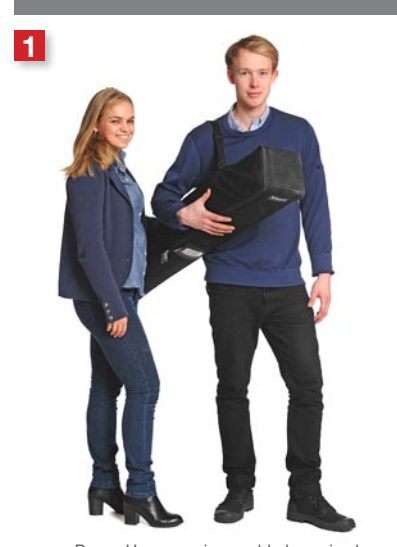
BannerUp comes in a padded carrying bag with shoulder strap.