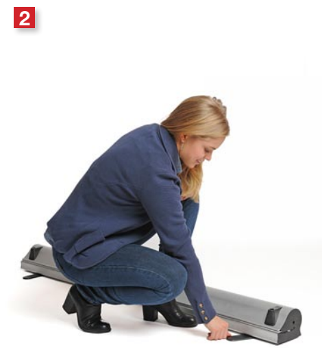
For increased stability pull out the four support legs on the cassette.