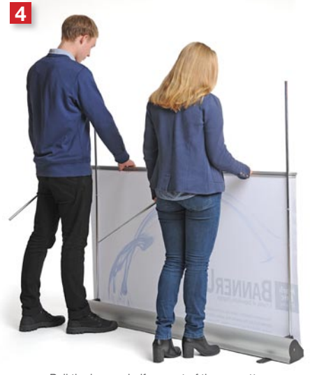
Pull the banner halfway out of the cassette.