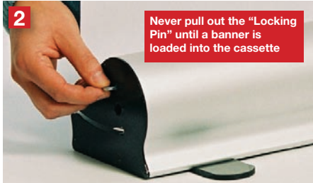
Hold the banner and remove the locking pin.