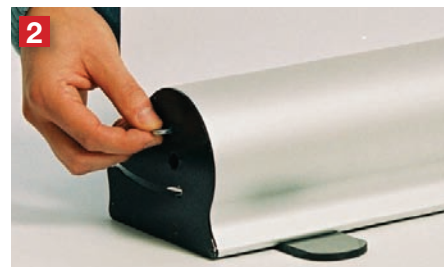
Insert the locking pin.