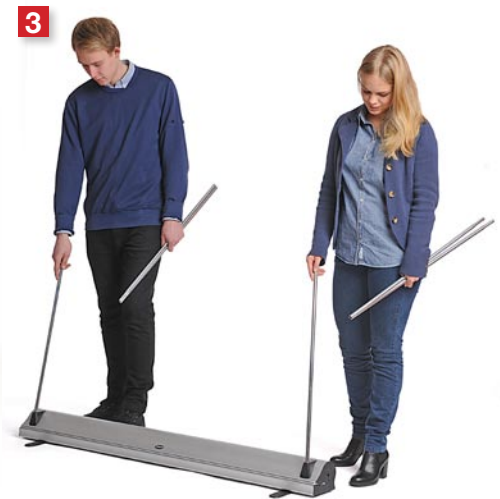
Take two sections of each pole set (start with the untapered) and mount these on each side of the cassette.