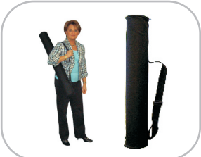
Rigid soft carry bag *(1) per stand w/ Package #BMT20