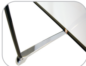
Chrome Weighted Base *Lifetime Warranty