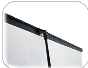
Top pole inserted *Lifetime Warranty