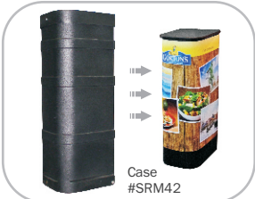
Compact wheeled ship case & podium kit * USA made