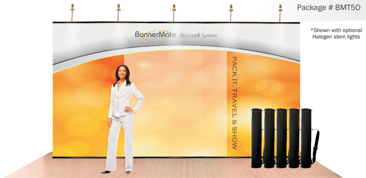
Package # BMT50

Weighs approx. 10 lbs. each (packed in rigid soft bag) Weighs approx. 42 lbs / 41 lbs (packed in CASSRM42) Weighs approx. 42 lbs / 51 lbs (packed with lights & podium kit)