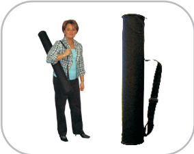
Rigid soft carry bag *(1) per stand w/ Package #BMT50