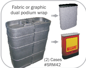
Compact wheeled ship cases & podium kit * USA made