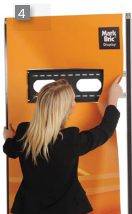
Attach the graphic panels