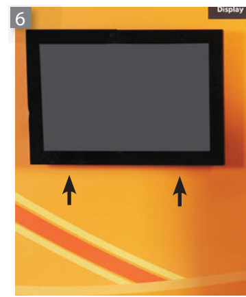
Lock the LCD with the two screws in the bottom of the screen rails!