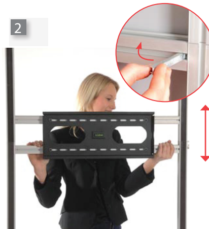
Attach the LCD holder in the system with the 4 FASTclamp locks.