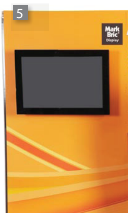
Hook on the LCD