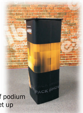
Back side of podium when set up